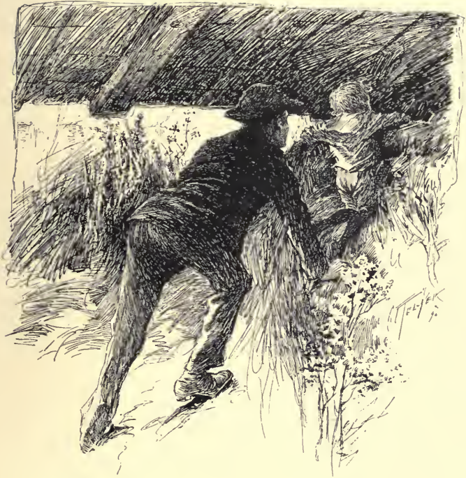
MIDGET REVEALS A SECRET.